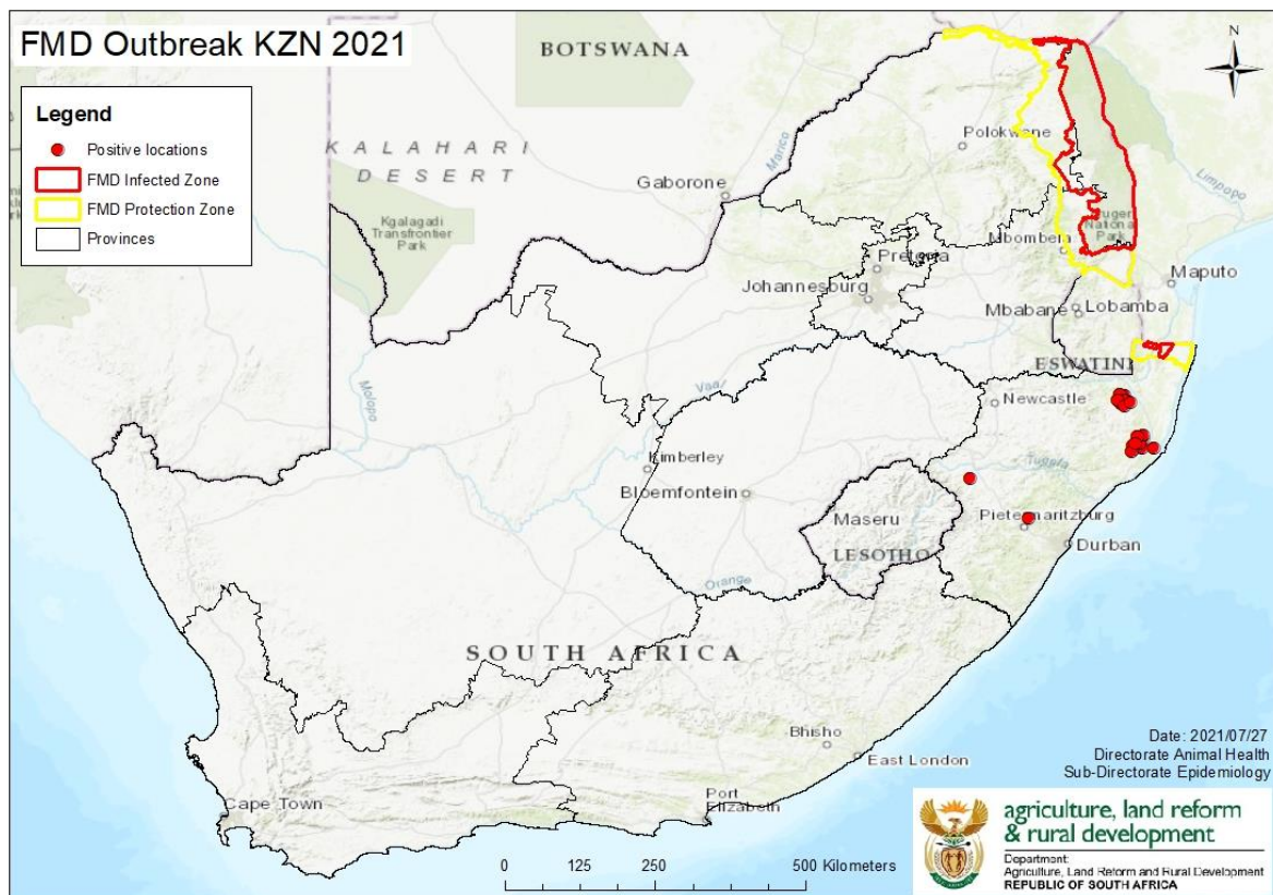
Map 1: FMD positive locations in KwaZulu-Natal, South Africa

In May 2021, an outbreak of Foot and Mouth Disease (FMD) in cattle was confirmed in the Umkhanyakude District Municipality of the KwaZulu-Natal Province. Twenty-two locations in KwaZulu-Natal Province have been identified as FMD positive and reported to the OIE. Disease investigations to determine the extent of the spread of disease are nearing completion. The following map shows positive locations. Note that locations with close proximity may appear as a single location on this map.